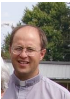
Taken September 6, 2009